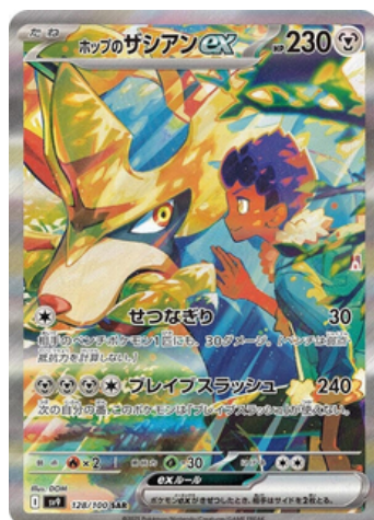
HOP'S ZACIAN EX バトルパートナーズ

Exciting news for Pokémon Trading Card Game fans! This month the Battle Partners set has officially launched in Japan, bringing a fresh wave of powerful cards, unique mechanics, and stunning artwork to the game.