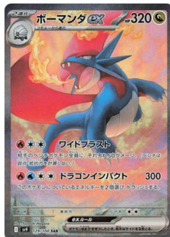
SALAMENCE EX バトルパートナーズ

Exciting news for Pokémon Trading Card Game fans! This month the Battle Partners set has officially launched in Japan, bringing a fresh wave of powerful cards, unique mechanics, and stunning artwork to the game.