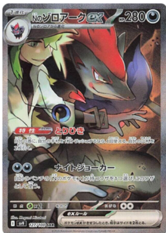
N'S ZOROARK EX バトルパートナーズ

Exciting news for Pokémon Trading Card Game fans! This month the Battle Partners set has officially launched in Japan, bringing a fresh wave of powerful cards, unique mechanics, and stunning artwork to the game.