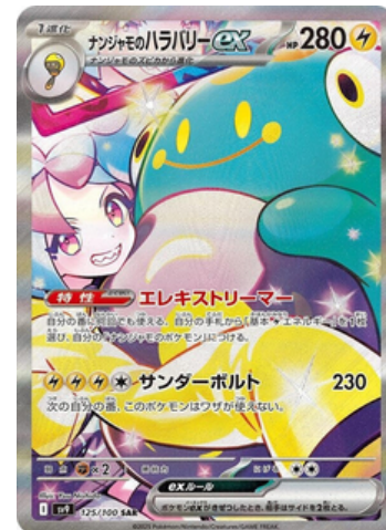
IONO'S BELLIBOLT EX バトルパートナーズ

Exciting news for Pokémon Trading Card Game fans! This month the Battle Partners set has officially launched in Japan, bringing a fresh wave of powerful cards, unique mechanics, and stunning artwork to the game.