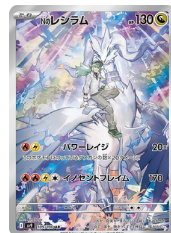
N'S RESHIRAM バトルパートナーズ

Exciting news for Pokémon Trading Card Game fans! This month the Battle Partners set has officially launched in Japan, bringing a fresh wave of powerful cards, unique mechanics, and stunning artwork to the game.