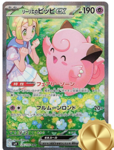
LILLIE'S CLEFAIRY EX バトルパートナーズ

Exciting news for Pokémon Trading Card Game fans! This month the Battle Partners set has officially launched in Japan, bringing a fresh wave of powerful cards, unique mechanics, and stunning artwork to the game.